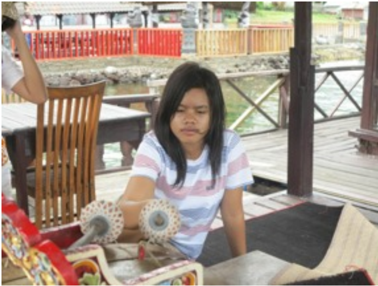
One of the students in SPH grade seven who was trying to play the Balinese gamelan.

There will be more than eight people who will be playing the gamelan. Now the music of Gamelan Bali becomes the tradition of Balinese people. The music is also developed through ancient times. Now they have other instruments that doesn't make the song old, but it is changing the traditional thing of the Gamelan.