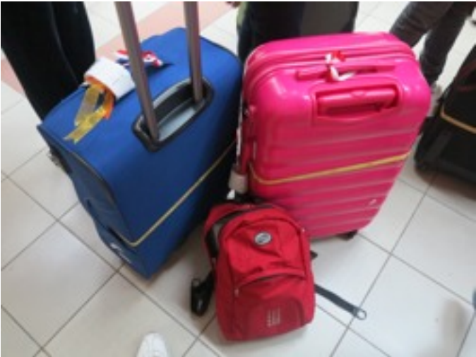
Luggage that made it to Denpasar airport