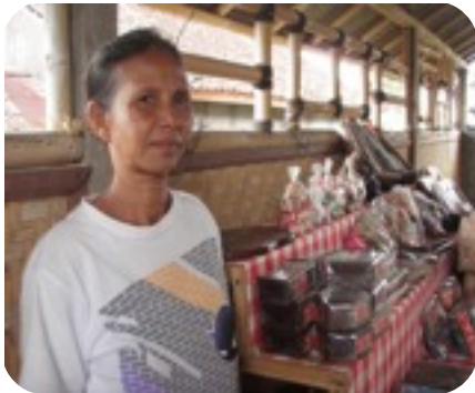
One of the Balinese women who makes traditional crafts as her job.

The Balinese people took advantages of their talents, like making crafts as their job. They can produce money out of their talent of making cool crafts although its not really fancy. Balinese people live in a really simple life with a very strong culture and happiness around them. Being happy is important because nobody wants to be sad, Balinese people have their own believe and own way to be happy and satisfy their selves but there are some ways that are the same with us and how we are happy to satisfy our selves.