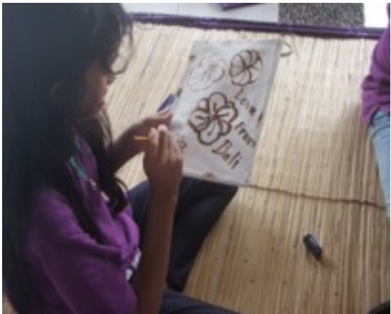
One of the students who is making Batik Bali in a canvas.

Having the freedom of expression is important and everybody should be proud to have their own way of expressing their selves. The freedom of expression should help us to receive and share to the society.