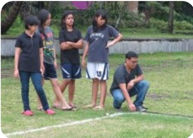
Four players waiting for the boxes to be done so they could play.

In the trip to Bali, we had some traditional games in Bali called the 'cat and mice'. The game rules are, there has to be more than 8 people. They have to make a circle and there will be one person as the mice and one as the cat. The person who is being the cat will stay outside the circle and the mice will be inside the circle of people. The cat will try to capture the mice by chasing him. The people who are the circle can lift up their hands so that the mice can be helped and escape from the cat. There is also the song for this game called 'meyong-meyong'. We should sing the song until the cat captures the mice. We also played a game like hopscotch. There is also the game that is like fighting. The game we played first is involving six squares on the ground. Pak wayan, the tour guide made the squares with chalk dust. The game rule is, there will be four members in each team. One person will guard one line of two boxes. The other group's target is to reach the other side without the opponent to touch them. The game was overall fun and traditional.